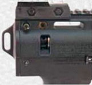
EXTERNAL VELOCITY ADJUSTOR