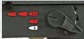
THREE POSITION SELECTOR SWITCH WITH FIVE FIRING MODES