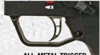
ALL-METAL TRIGGER ENHANCES STABILITY