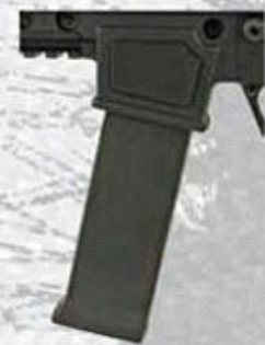
QUICK RELEASE MAGAZINE DESIGN WITH BUILT-IN TOOL STORAGE