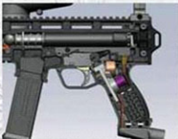
INTERNAL GASLINE - NO TOOLS REQUIRED FOR DISCONNECTION