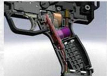
MAGNETICALLY ACTIVATED HALL EFFECT ELECTRONICS - WEATHER AND CORROSION RESISTANT